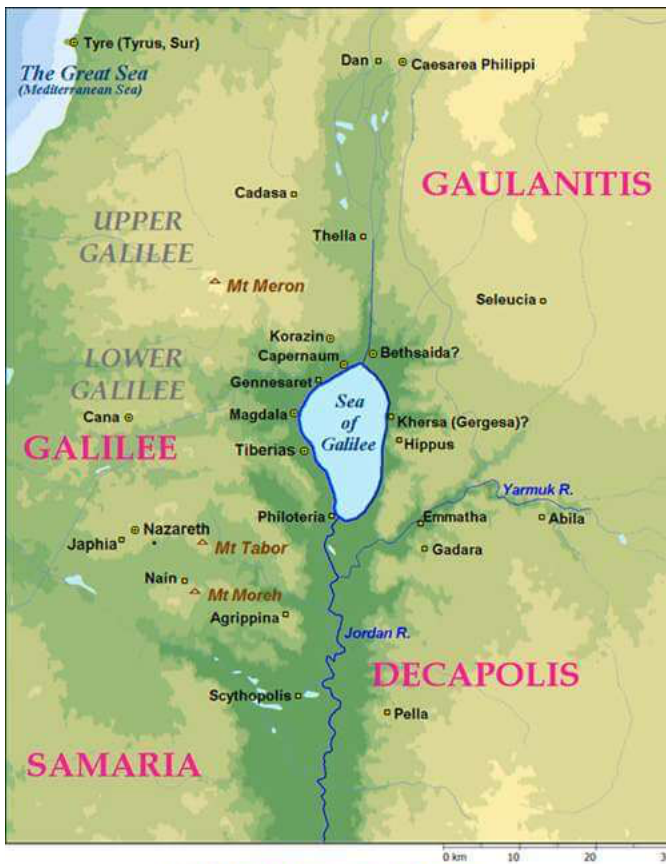
Galilean Ministry of Jesus

Place is important in Luke’s Gospel. The life of Jesus begins in Jerusalem with his birth in nearby Bethlehem and his dedication six weeks later in the temple in Jerusalem. His life ends in Jerusalem with the events of his crucifixion, death, and resurrection. Between these beginning and ending points, Luke places the bulk of Jesus’ public ministry either in the northern region of Galilee, or on his way from Galilee to Jerusalem for the final week of his passion. Throughout Luke’s Gospel are reports of many conversations Jesus had, or that were had about him. This lesson provides an approach to studying these conversations from a kind of journalistic perspective using the 5 W’s and encourages their use not as a dispassionate reporter, but more as an engaged eyewitness to what Luke describes.